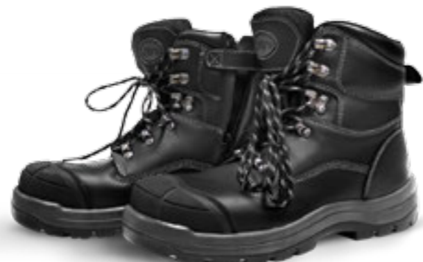
BLACK - PREMIUM FULL GRAIN LEATHER