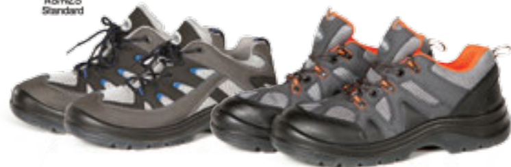
9E6 - GREY/ROYAL

AS/NZS 2210.3.2009 Class 1 SMKH25238 SAI GLOBAL