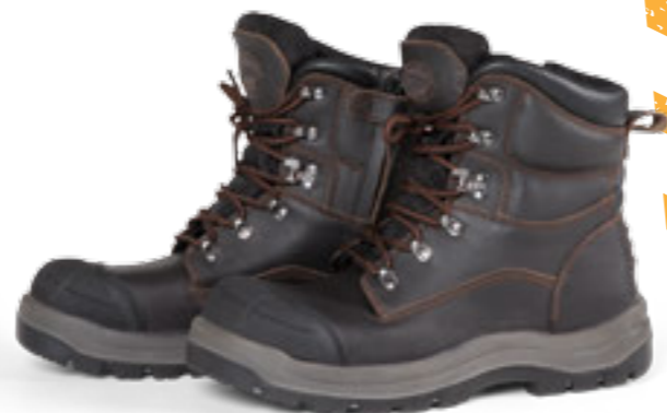
CLARET - PREMIUM FULL GRAIN LEATHER

Sizes | 6 | 7 | 7½ | 8 | 8½ | 9 | 9½ | 10 | 10½ | 11 | 11½ | 12 | 13 | 14