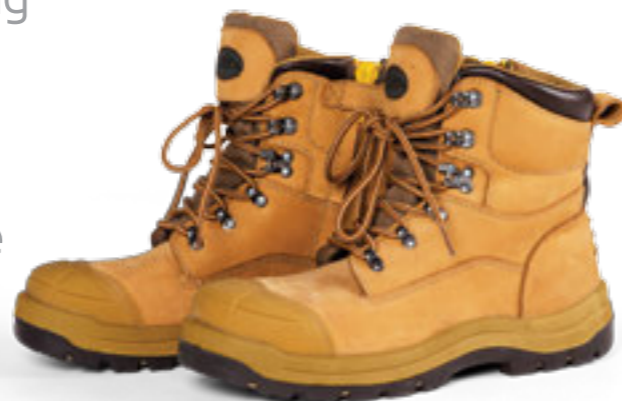
WHEAT - NUBUCK LEATHER