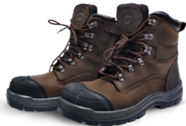
WAXY BROWN - NUBUCK FULL LEATHER