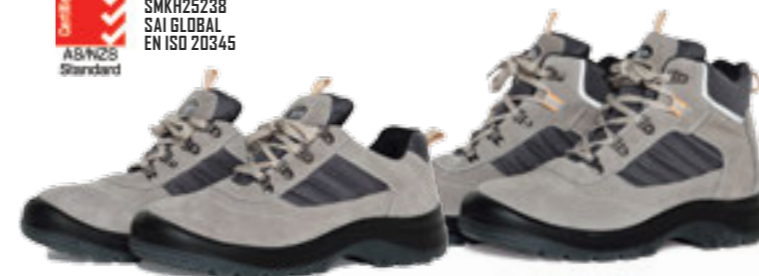
9E2 - DESERT

AS/NZS 2210.3.2009 Class 1 SMKH25238 SAI GLOBAL EN ISO 20345