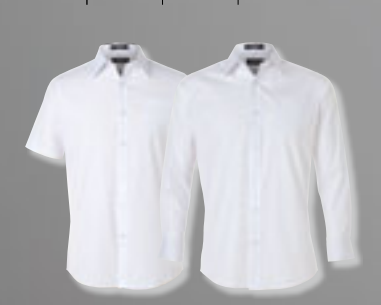
Available sleeve lengths